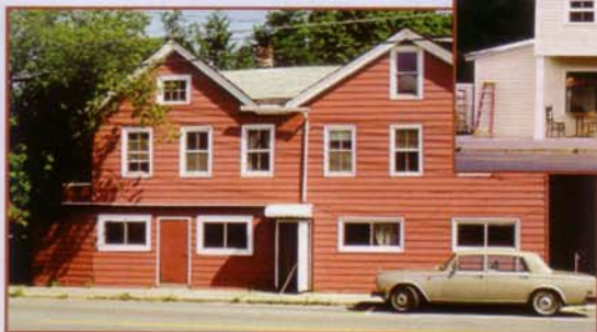
The Kitchen restaurant in Jeffersonville, shown before and after rehabilitation, is a Main Street Redevelopment Center success story.